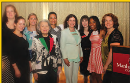
Inaugural group of participating teachers in the Rose Institute for Learning and Literacy program

Institute will start a trend in teacher-training throughout higher education. "It has the potential to be a model for other colleges and universities," she said.